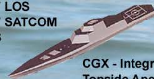
CGX - Integrated Topside Apertures