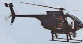
AH-6 - RS170 IITV (MTS)