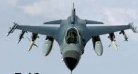
F-16 - GPS CRPA/FRPA