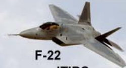
F-22 - JTIDS