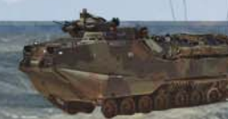
AAV - UHF SATCOM