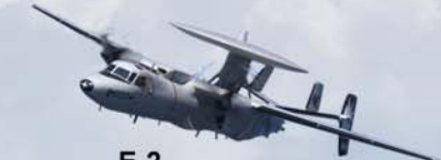
E-2 - MATT SATCOM