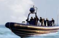
RHIB - GPS - IFF - UHF SATCOM - UHF LOS - UHF Marine Band - X-band Radar