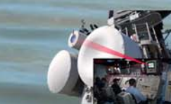
CVN/LHD - NATO Seasparrow Camera