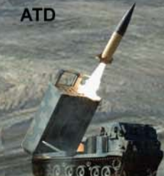
ATACMS - GPS CRPA