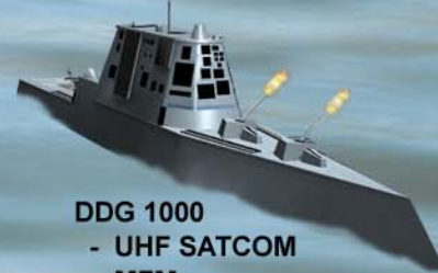
DDG 1000 - UHF SATCOM - MFM