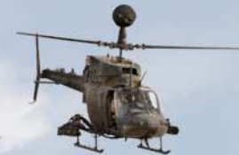
OH58 - MMS (HDTV Day Camera)