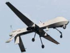
Predator - RS170 IITV (MTS)