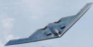
B-2 - CNI Suite