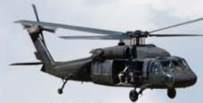
UH-60 - RS170 IITV (Q2)