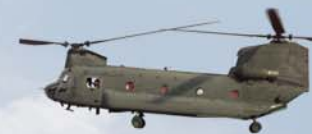
UH-47 - RS 170 IITV (Q2, Q3)