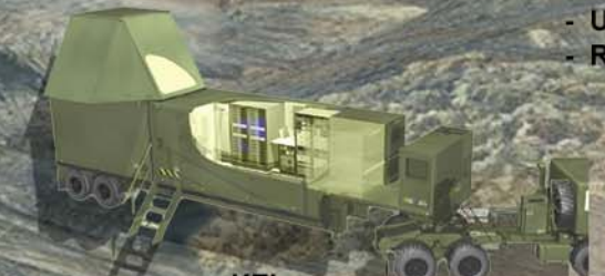
KEI - C-Band Phased Arrays