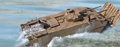
EFV Comm System Integrator - Conformal SATCOM - Conformal MFA (UHF LOS, EPLRS, GPS) - VCU - HPA/LNA - Intercom Antenna