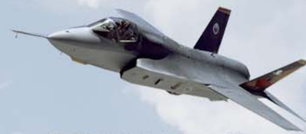
F-35 Lightning II (IBA) - UHF Sat/LOS, LOS L Band (Link16, IFF, Tacan) Training (JTCTS, RAIDS) Radar Altimeter