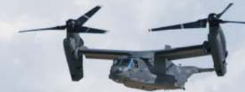
CV22 - Antenna Study